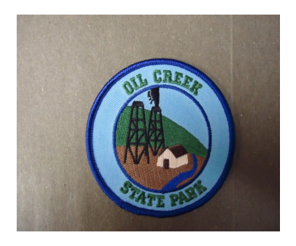
Friends of Oil Creek Patch $ 3.00 + Tax