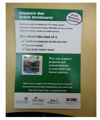
Oil Creek State Park Pin $ 5.00 + Tax