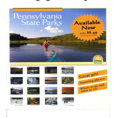
Pennsylvania State Park Calendars $8.49 + Tax

All proceeds benefit the educational programs, events and focus projects within Oil Creek State Park.