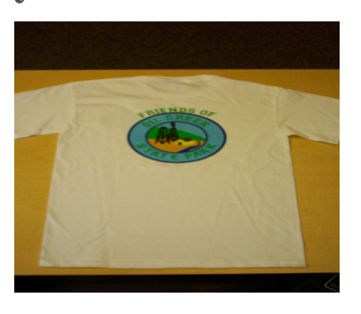
Friends of Oil Creek State Park T-Shirts $ 15.00