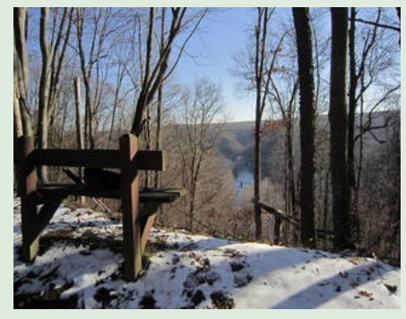
Overlook at Benninghoff