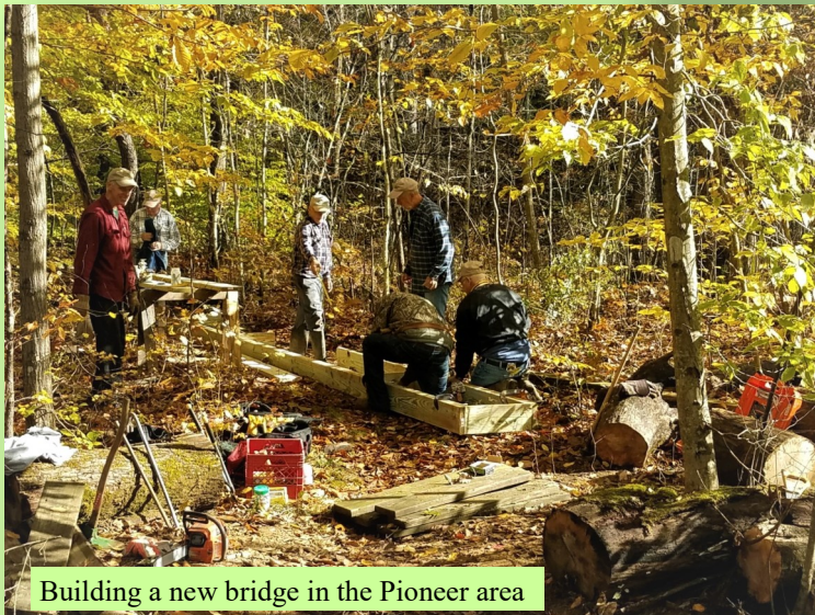
Building a new bridge in the Pioneer area