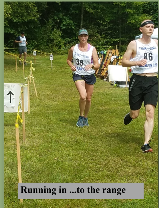
Running in ...to the range