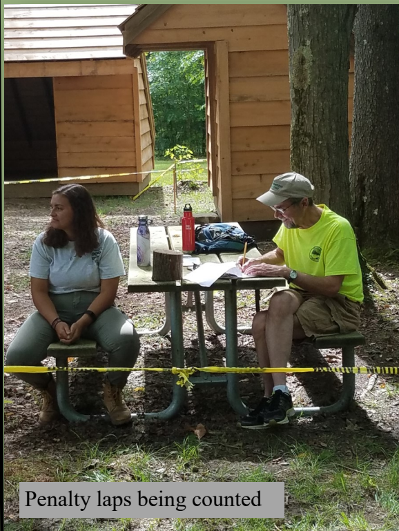
Penalty laps being counted