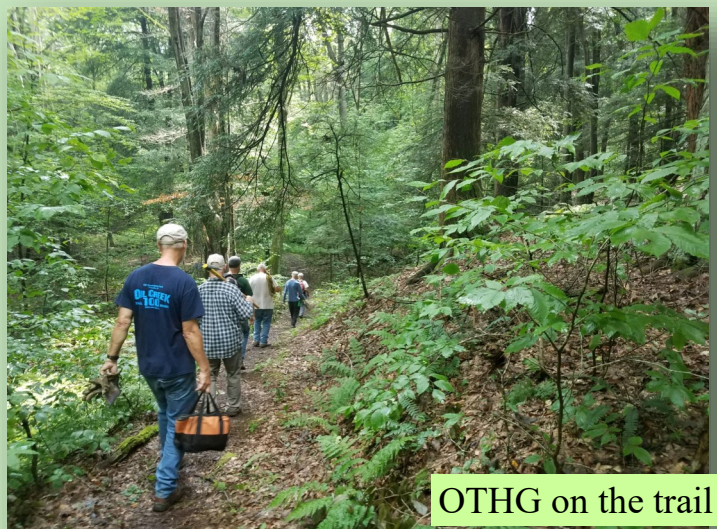
OTHG on the trail