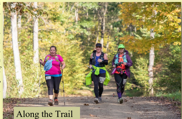
Along the Trail