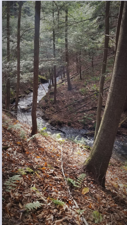
Plum Dudgeon Run

The Friends of Oil Creek State Park is a Chapter of the Pennsylvania Parks and Forest Foundation