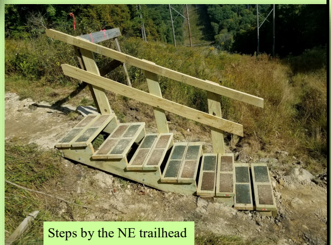
Steps by the NE trailhead