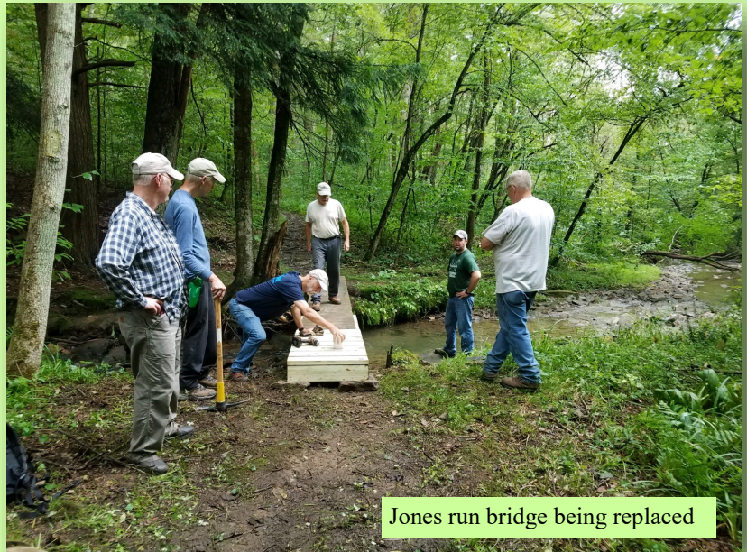
Jones run bridge being replaced

Trees downed by high winds and erosion were a weekly concern, but all trails were kept open. Weed, fern, and multiflora growth appeared heavier than usual, resulting in a need for more fre-