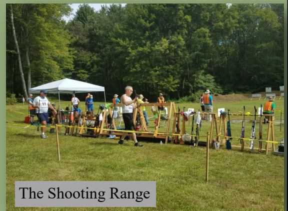
The Shooting Range